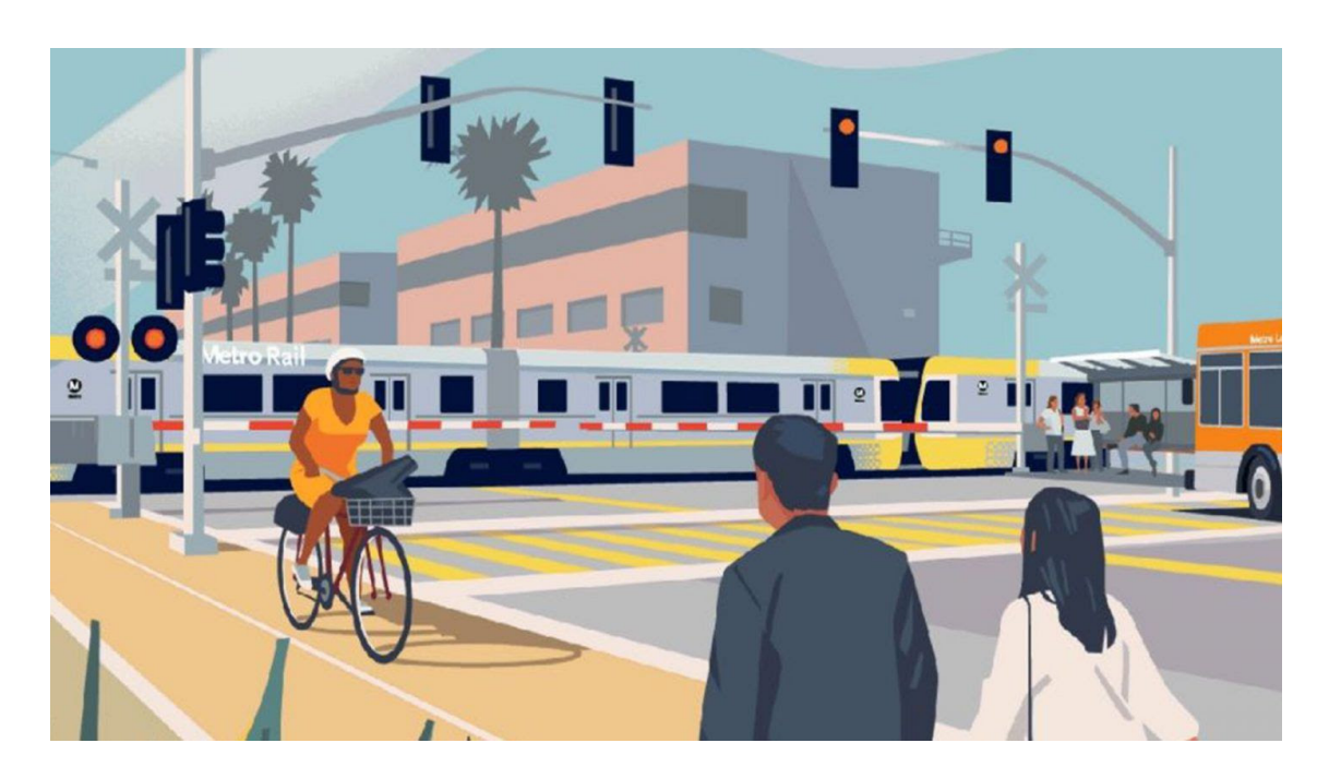
Monterey Park and South Pasadena Receive $12 Million for Active Transportation Projects from Metro

The Metro Board of Directors approved 16 active transportation and first/last mile projects across Los Angeles County in January 2021. 2 of the 16 selected projects are located in Monterey Park and South Pasadena. The projects will be funded through the first cycle of Measure M Metro Active Transport, Transit, and First/Last Mile (MAT) Program from FY 2021 to FY 2025.