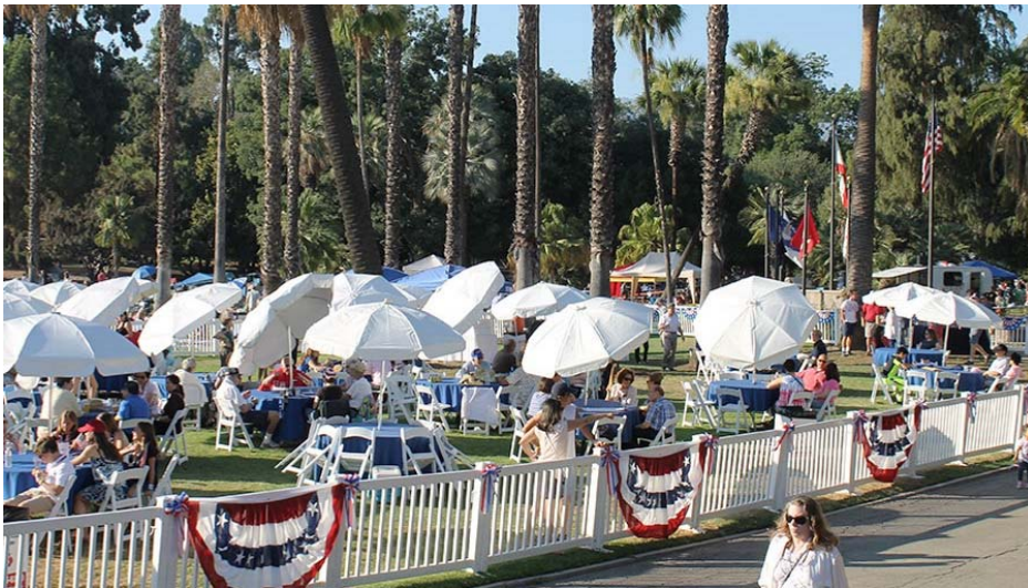
City of San Marino 4th of July Celebration