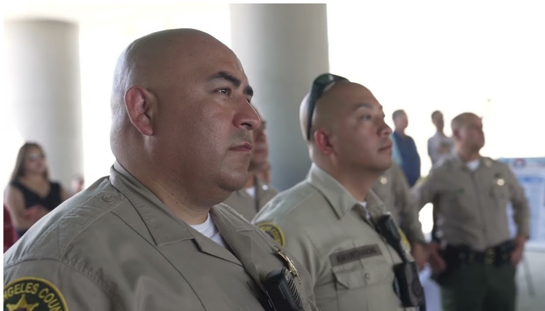
(Click the video to watch the City of Industry's exciting recap of the event!)

the efforts of several stakeholders and funding sources, including the State Prop 1B Trade Corridor Improvement Fund, Section 190 Grade Separation Program, Los Angeles County Metro Prop C and Measure R funds, City of Industry, and Union Pacific Railroad.