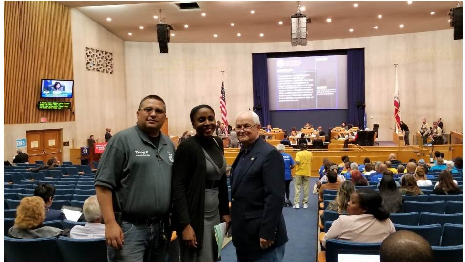
Representatives from SGVCOG, Duarte, and Claremont.

The proposed pilot, known as the "Housing for Public Health," will include strategically deployed public health and homeless outreach personnel.