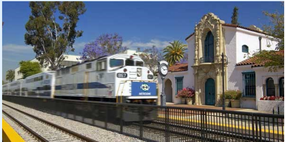
City of Claremont Train Depot

Planners TAC 602 E. Huntington Dr., Monrovia