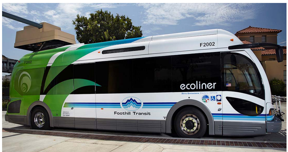
Foothill Transit Electric Bus

On May 27, the Foothill Transit Executive Board Authorized the agency to serve as the lead on a technical study focusing on the Ramona Boulevard segment between El Monte Bus Station and the Baldwin Park Transit Center as a demonstration phase of the San Gabriel Valley Mid-Valley eBRT Project.