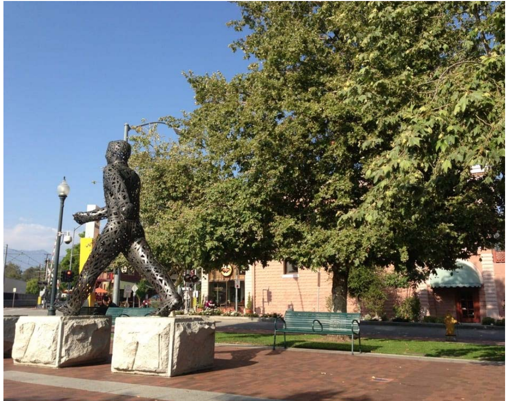
City of South Pasadena Gold Line Station

Homelessness Committee 602 E. Huntington Dr., Monrovia