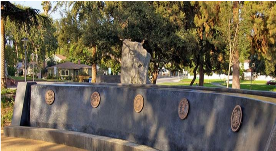
City of Alhambra Veterans Memorial