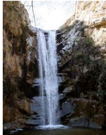
Trail Canyon Falls San Gabriel Mountains

where it is expected to be reviewed and released for public comment on June 9 th . The state intends to formally adopt the final 2016 list by this fall.