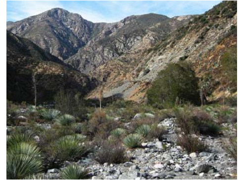
SGM National Monument

On May 18, the SGVCOG Governing Board adopted a resolution to support the San Gabriel Mountains National Monument designation as currently configured.