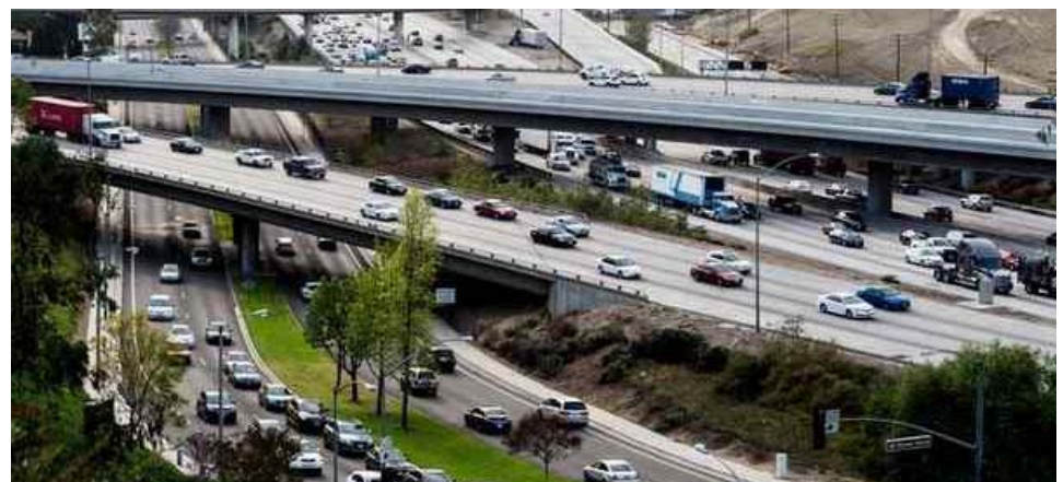
60/57 Interchange Diamond Bar