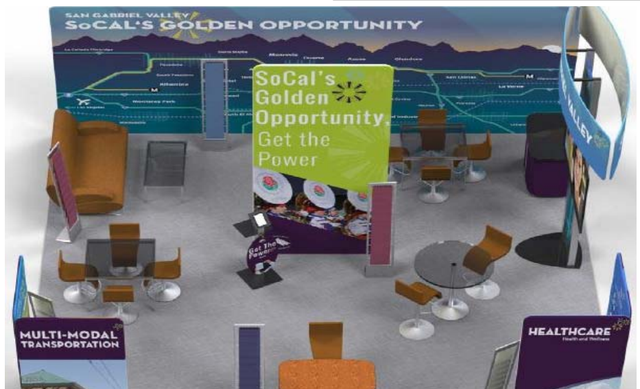
SGVEWP Golden Opportunity Exhibit