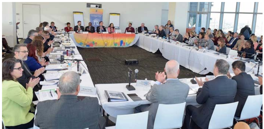
Measure H Planning Group

The SGVCOG is hopeful that it can play a significant role in coordinating, leveraging and enhancing the work of cities and service providers to combat the homelessness crisis once Measure H funds are made available.