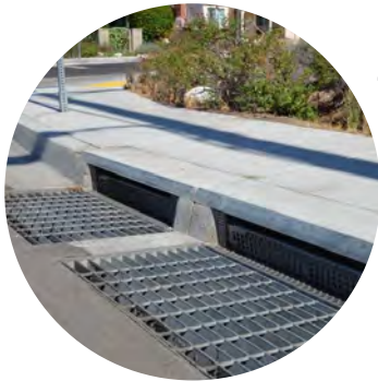
Water Quality & Stormwater