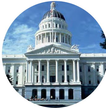
Legislative & Regulatory Advocacy