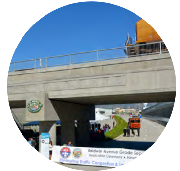
Large Capital Transportation Projects Item #10 Page 3 of 17