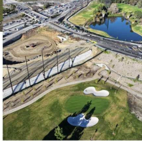
Embankment for Grand Ave on- and off-ramp