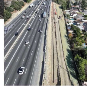
Retaining wall construction along eastbound SR-60