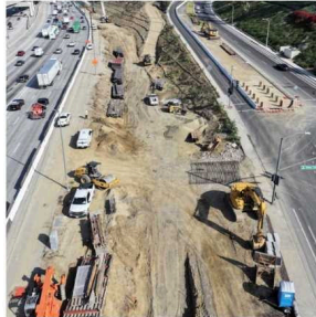
Relocation of sanitary sewer line