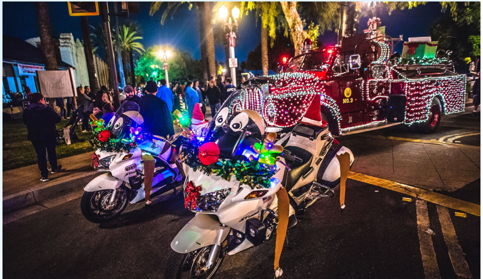
City of San Gabriel's Christmas Celebration