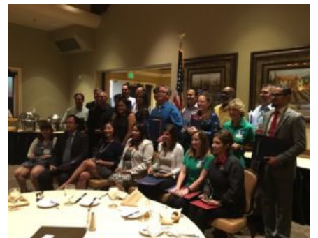
Three Valleys MWD Receives ACWA Outreach Award

SGVCOG congratulates Three Valleys MWD for this outstanding and remarkable achievement and thanks ACWA for recognizing Three Valleys MWD's commitment in public outreach.