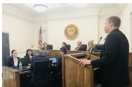
SGVCOG Staff Provides Overview of ELP to the San Marino City Council