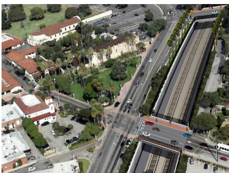
San Gabriel Trench Grade Separation: Aerial View

This grade separation project reduces emissions and improves public safety by eliminating an estimated 1,744 vehicle-hours of delay for nearly 90,000 motorists traveling each day on the four grade-separated streets. This project involved a 1.4-mile concrete-walled trench and the roadway bridges at Ramona Street, Mission Road, Del Mar Avenue, and San Gabriel Boulevard. Major construction activities began in Spring 2014, following an extensive archaeological excavation across the street from the historic San Gabriel Mission. The project was completed in September 2018. SGVCOG representatives are scheduled to receive the award at the APWA Southern California Chapter's Awards Luncheon on December 12th at the Lakewood Civic Center. For more information on APWA's B.E.S.T. Award, please visit southernca.apwa.net .