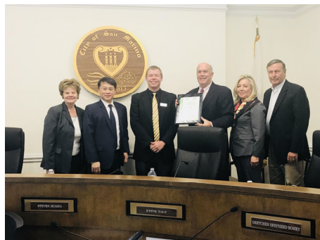
San Marino City Council Receives ELP Award

Recently, the City of San Marino was recognized for achieving the Gold tier. The City of San Marino has achieved 493,492 in kilowatt-hour savings and received $39,237.72 in rebate incentives since 2006. On November 14th, SGVCOG and Southern California Edison representatives attended the San Marino City Council meeting to congratulate San Marino city officials for their extraordinary efforts in conserving energy. To learn more about the Energy Leader Program, please visit the SGVEWP website at sgvenergywise.org .