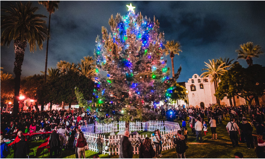
Holiday Tree Lighting at the San Gabriel Mission