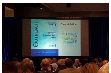
Three Valleys MWD Named Winner of Outreach Award at the 2017 ACWA Fall Conference