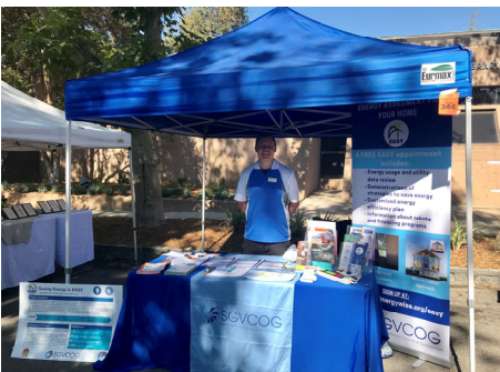
SGVCOG's Booth at the Claremont Family Venture

For more information or to sign up for SGVEWP's free EASY and SGV Go Green energy assessment programs, please call (626) 457-1800 or visit the SGVEWP website at www.sgvenergywise.org .